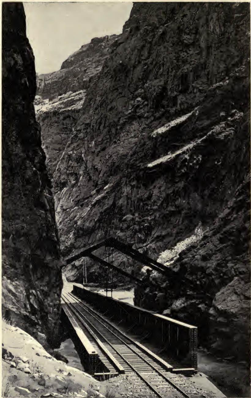
GRAND CANON OF THE ARKANSAS THE ROYAL GORGE AND SUSPENDED BRIDGE